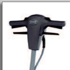
Ergonomically designed & comfortable to use handle