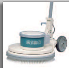
Low housing profile