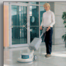
Optional solution tank