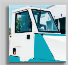
800 with cabin