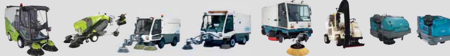
600 SERIES 400 SERIES A60 A80 SENTINEL® ATLV® 4300 S30 M30

TENNANT UK Bankside, Falkirk FK2 7XE, Scotland, UNITED KINGDOM. Tel: (+44) 1324-611666 Fax: (+44) 1324-611886 e-mail: sales@greenmachines.com